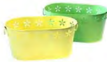
5 ½" Basins