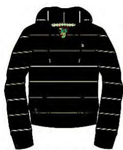
Do it Over Hoody 3863606

Surface paint on the outer sole of these shoes contains high amounts of lead. The shoes were sold at Nordstrom stores nationwide from September 2006 through February 2009.